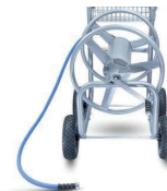
6ft. Lead-in hose