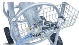
Built-in Accessory Basket