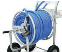
Holds upto 400 ft.