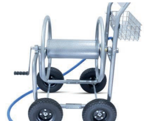
Corrosion resistant powder coated finish