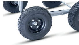
Easy rolling 10in. flat tyres