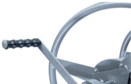
Strong tubular steel frame

Heavy-duty Garden Hose Reel Cart holds 400 feet of 5/8in. garden hose (not included). Features strong tubular steel frame and foam-padded handle. Rolls easily on 10in. pneumatic tires with solid steel axles. Built-in basket for accessories.