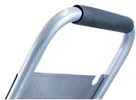
Form padding handle for comfort