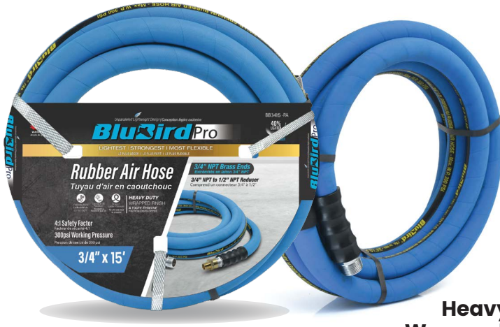
Heavy-Duty Wrapped Finish

40% Lighter Than Traditional Rubber Air Hoses 100% Rubber