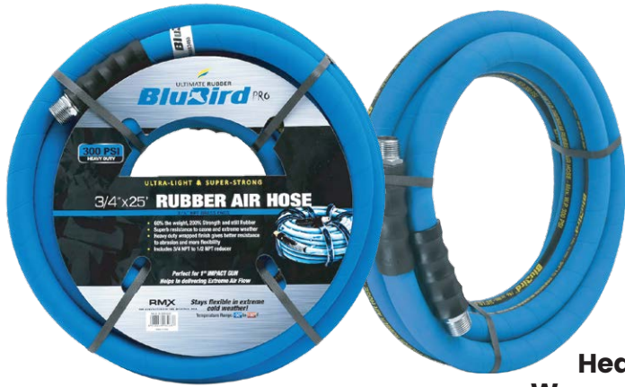
Heavy-Duty Wrapped Finish