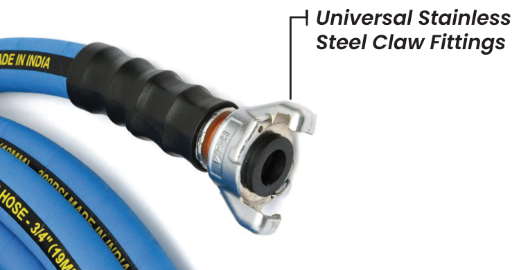
Universal Stainless Steel Claw Fittings

BluBird Jack-Hammer hoses are 9 lbs lighter than standard rubber jack-hammer hoses and are stronger & more flexible. Designed to offer exceptional flexibility even in extreme conditions down to -50°F up to +190°F these hoses can be used year-round in most parts of the world. These hoses are constructed with abrasion resistant external covers and high-strength polyester woven reinforcement to prevent elongation and add superior strength with a 300 PSI working pressure and 4:1 safety factor. The heavy-duty wrapped finish prevents the hose from damage and wear in different applications and environments. The BluBird Jack-hammer hose features universal stainless steel claw fittings for longer life vs cast iron fittings.