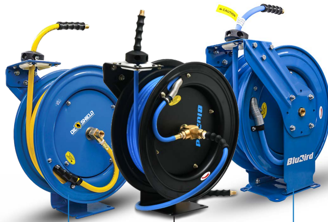
Single -Arm Air Hose Reel with 18 ga. Heavy-Duty Steel Construction