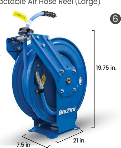
20 GA Heavy-Duty Dual-Arm Retractable Air Hose Reel (Large)