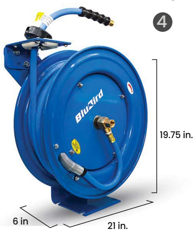
20 GA Heavy-Duty Single-Arm Retractable Air Hose Reel (Large)