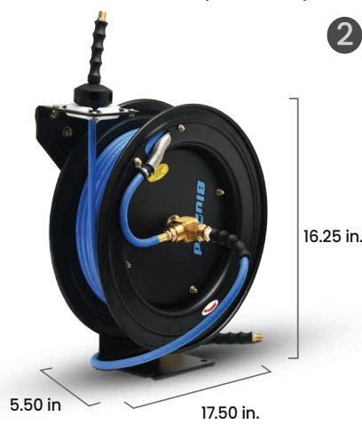
20 GA Single-Arm Retractable Air Hose Reel (Medium)