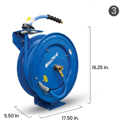
20 GA Heavy-Duty Single-Arm Retractable Air Hose Reel (Medium)