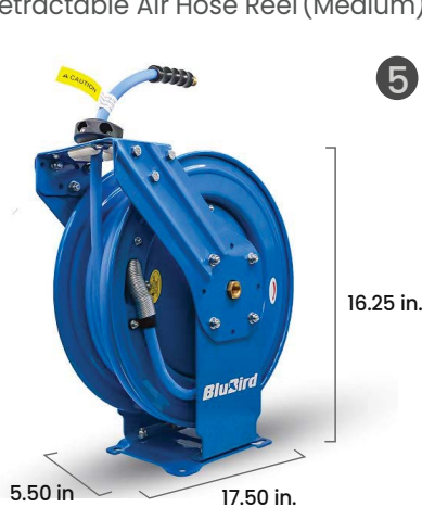
20 GA Heavy-Duty Dual-Arm Retractable Air Hose Reel (Medium)