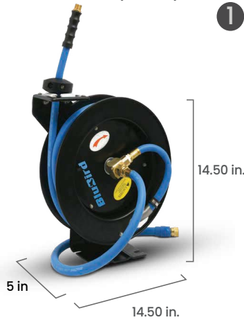
20 GA Single-Arm Retractable Air Hose Reel (Small)