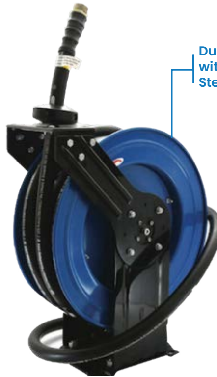
Dual Arm Air Hose Reel with 18 ga. Heavy Duty Steel Construction