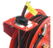
Four rollers reduce hose wear