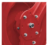
12 point ratchet gearing system