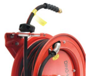
Comes with Rubber Stopper